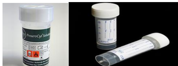
(a) Preservcyt (b) Sterile Universal Container

All neat fluids should be placed in a standard universal container and sent unfixed to the lab. If large amounts of fluid are present then mix the whole specimen and submit a suitable quantity of a representative sample in a sterile universal container to the lab. Exudates often tend to clot and cells are trapped within this. If a clot is noticed in a fluid, this must also be sent along with the fluid.