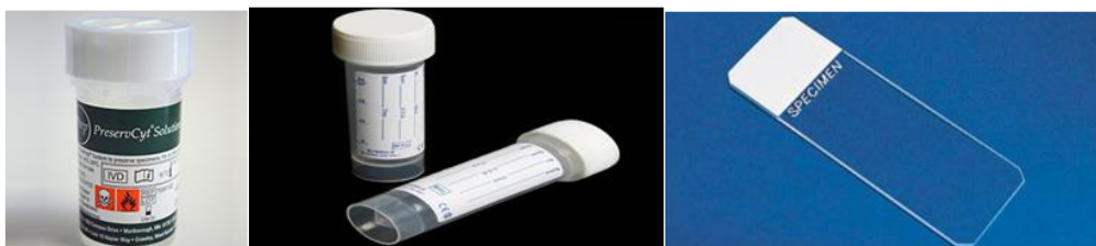
(a) Preservcyt (b) Sterile Universal Container (c) Microscope glass slide

Biliary brushings and any other material obtained by brushing should be rinsed in a sterile universal pot containing cytolyt contained in a sterile universal container