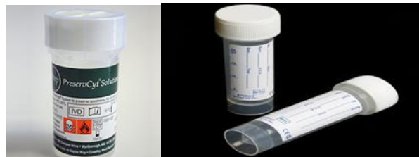
(a) Preservcyt (b) Sterile Universal Container

Specimen Container: All neat fluids should be placed in a standard universal container and sent unfixed to the lab. If large amounts of fluid are present then mix the whole specimen and submit a suitable quantity of a representative sample in a sterile universal container to the lab. Exudates often tend to clot and cells are trapped within this. If a clot is noticed in a fluid, this must also be sent along with the fluid.