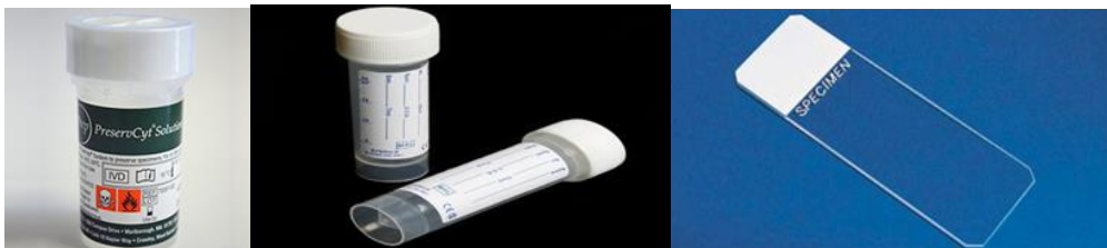
(a) Preservcyt (b) Sterile Universal Container (c) Microscope glass slide

Biliary brushings and any other material obtained by brushing should be rinsed in a sterile universal pot containing cytolyt contained in a sterile universal container