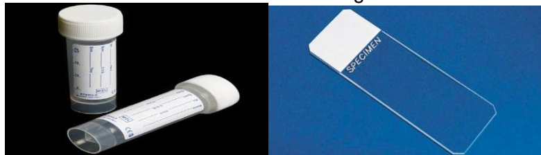
(a) Sterile Universal Container

The Slide must be placed in a plastic slide mailer while the washings must be collected in sample sterile universal pot containing saline or balanced salt solution.